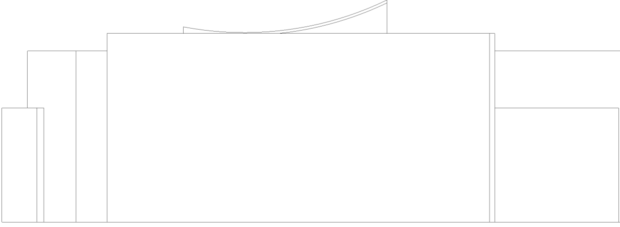
Alçado Poente 1:100